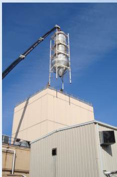
100 ton crane removing 65 ft. spray dryer

As experts in managing liquidation and surplus equipment sales, we get top dollar for your used equipment and we have the tools to do it. Our extensive worldwide network, especially Latin America, markets to targeted customers. We can handle any size liquidation project, from a single item to an entire plant operation. We have a proven track record for liquidating complete plants.